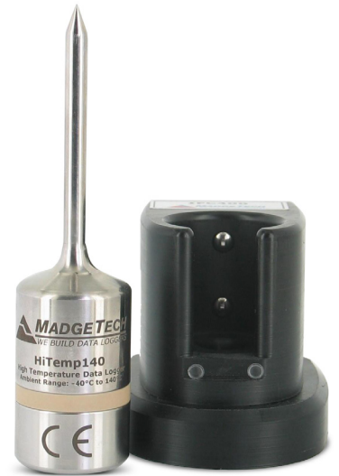
IFC400 ( sold separately )

Using the MadgeTech Software, starting, stopping and downloading the HiTemp140 is simple and easy. To use, simply place the HiTemp140 in the IFC400 or IFC406 docking station ( sold separately ). Using the software, an immediate or delay start can be chosen, as well as the reading rate. Start the data logger, remove it from the docking station and the device is ready to be deployed. Graphical, tabular and summary data is provided for analysis and data can be viewed in °C, °F, K or °R. The data can also be automatically exported to Excel® for further calculations.